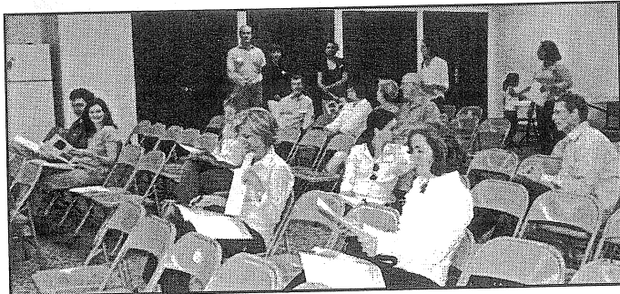
Neighbors from Brookhaven and North Buckhead attending the kick-off planning meeting.

On September 23, the new Friends of Little Nancy Creek Park group held its first public planning session. This was the beginning of a ten-month process to envision what features and improvements the park on Peachtree Dunwoody Road at Winall Down Road will ultimately have.