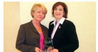
Piedmont Park Conservancy Corporate Category