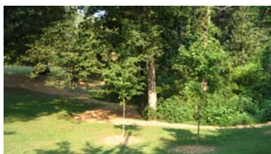
July: Beecher Circle Park

Park Pride initiated the Park of the Month program in conjunction with the Department of Parks, Recreation and Cultural Affairs (DPRCA). During "park season" - from April through October - the Office of Parks nominates 5 parks to be considered for Park of the Month. Park Pride visits the nominated parks and judges them against the City's standards for park maintenance. Among the criteria are the condition of the lawn and planting beds, cleanliness, hazards and graffiti. The park that best meets these criteria is named Park of the Month. At the end of the year, Park Pride recognizes a park of the year from amongst the monthly winners, and the City rewards the crew members responsible for maintaining a park well enough to be named Park of the Year.