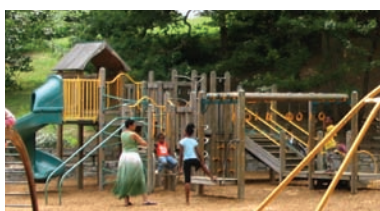
June: Candler Park