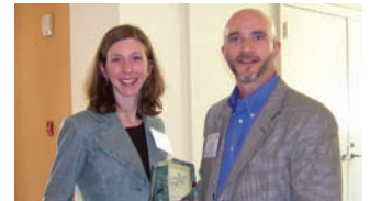
Friends of Oakhurst Greenspace (FROGS) Community Category