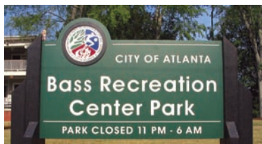
May: Bass Park