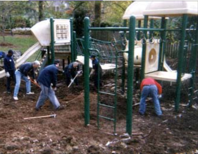
Volunteers Assemble New Park Equipment

Park Pride is pleased to announce an exciting new program to provide financial support for communities working to improve their parks. Throughout Atlanta, people like you are working with their neighbors to build new flower beds, plant