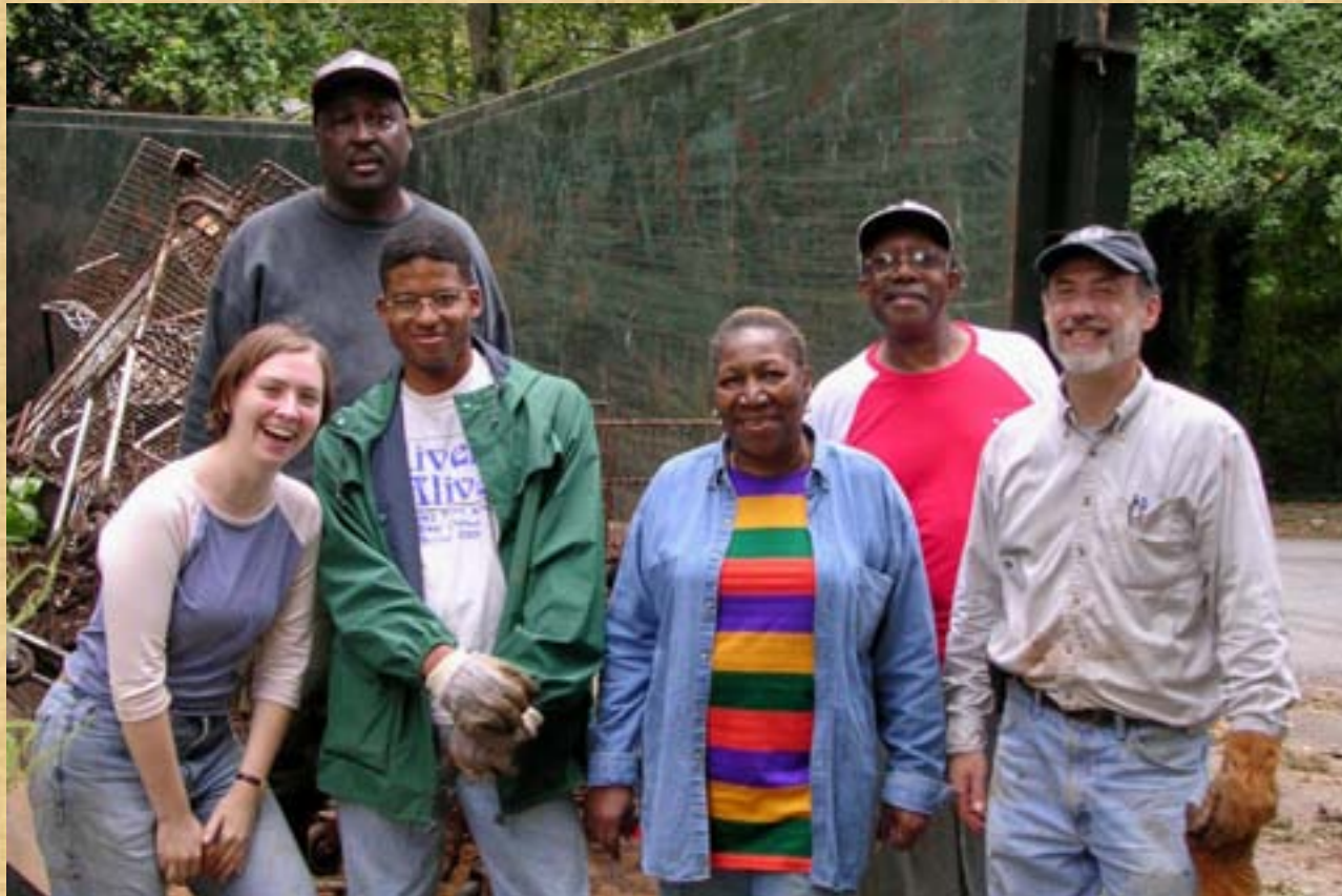
Belvedere Park Community