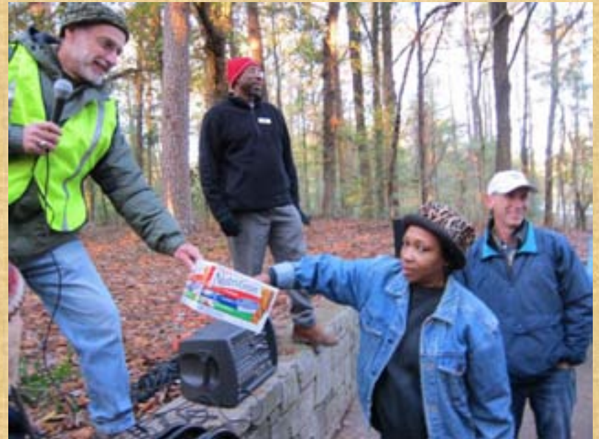
Dearborn Park – Park Renewal Day