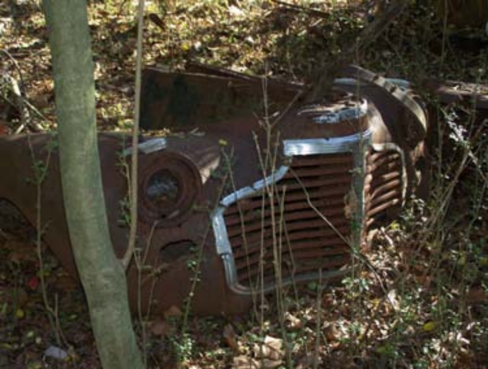
Five Star - Evans Mill Historic Site