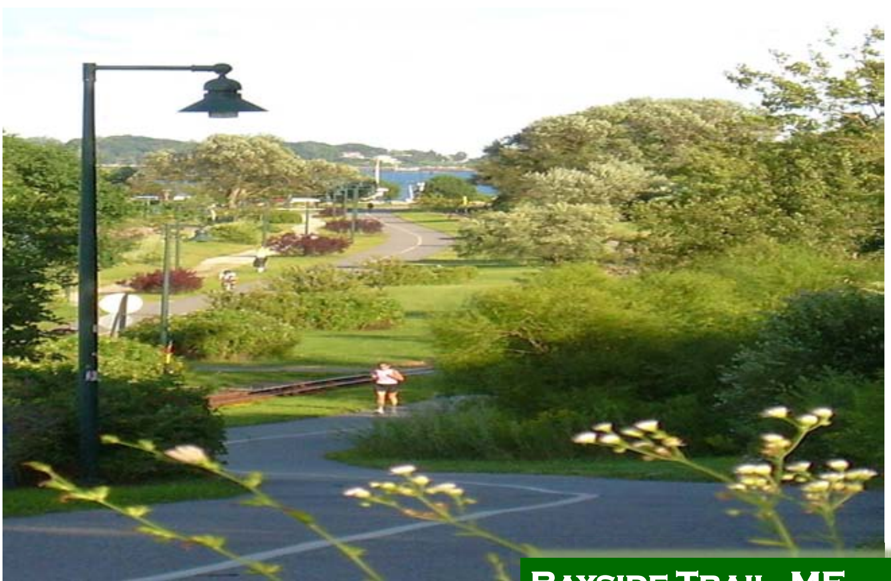
BAYSIDE TRAIL, ME

THE TRUST for PUBLIC LAND CONSERVING LAND FOR PEOPLE